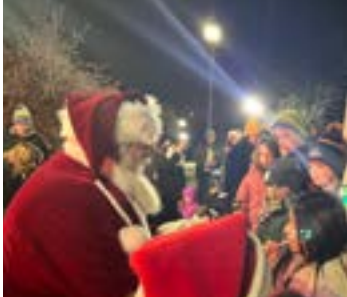
Grenville Baker Boys & Girls Club • 135 Forest Avenue • Locust Valley NY 11560